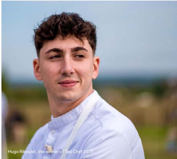
Hugo Riboulet, the winner of Top Chef 2023